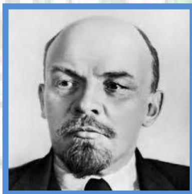
V. I. Lenin (1870-1924).

Source: http://en.wikipedia.org/wiki/Vladimir_Lenin