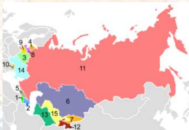
Post-Soviet states (alphabetical order)

Most of post communist societies today are witnessing intensified ethnic strife along with other problems. The society has to adopt the values of pluralism and tolerance to wade through difficult times. Since these societies have been subjected to socialist economy and politics for many decades, they will take time to adjust their systems with new changes. A study by Joseph Stiglitz highlights the problem created in such societies by the sudden replacement of one system with other. The problems were compounded by the interferences of international institutions like IMF and other. 31